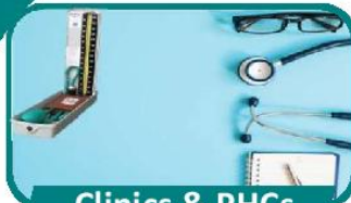
Clinics & PHCs