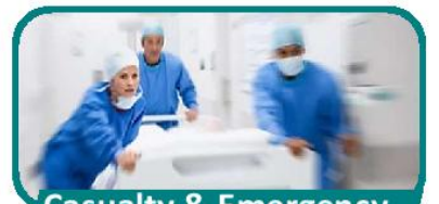
Casualty & Emergency