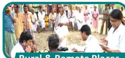
Rural & Remote Places