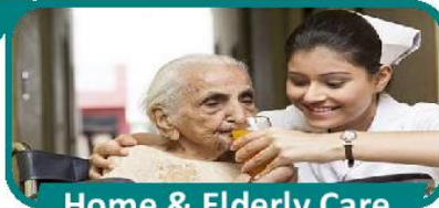
Home & Elderly Care